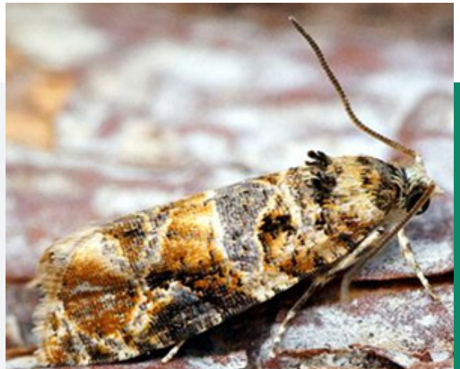
European grapevine moth ( Lobesia botrana )