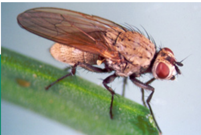
Onion maggot ( Delia antiqua )