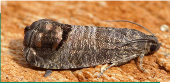
Codling moth ( Cydia pomonella )